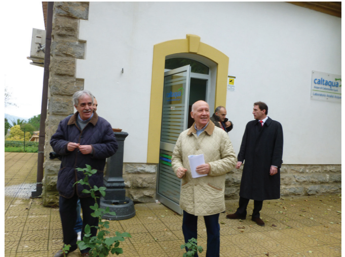
Several visitors next to the gate to the facilities.