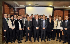
Human Resources Meeting at FCC