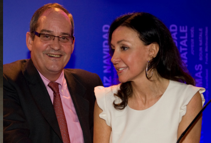
FCC wins CC.OO. Corporate Social Responsibility Award