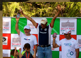
Aqualia athletes reap success in Mexico and Santiago de Compostela