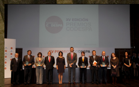
FCC volunteers honoured at the 11th edition of the CODESPA Awards