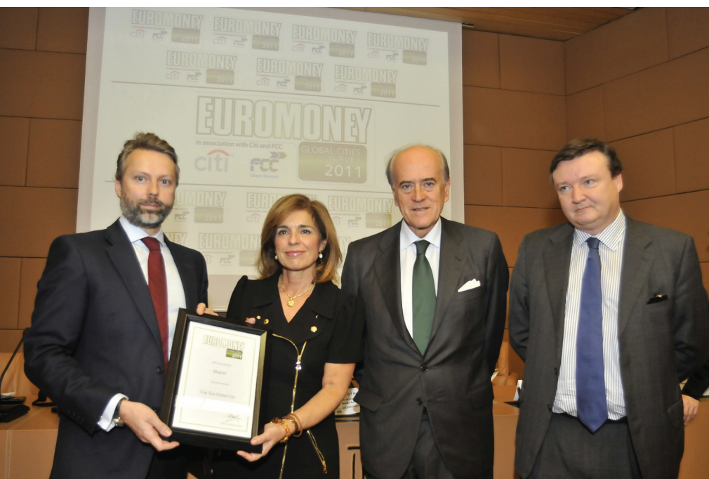
Ana Botella, mayor of Madrid, collects the price awarded to Madrid, rated the seventh most competitive and attractive city for conducting business.

ve citizens' living standards, which they will do either by investing in infrastructure and transportation, creating a green economy, or simply addressing the most urgent challenges, such as urban planning.